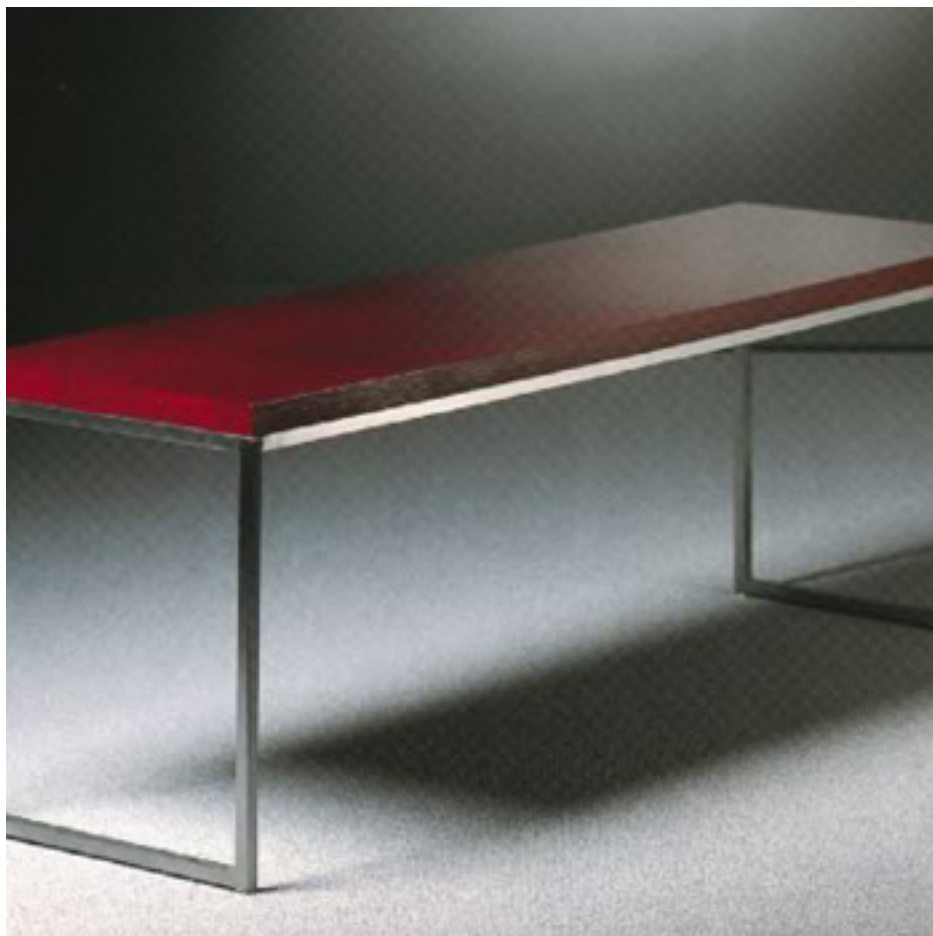
Height 30 in, Width 84 in, Depth 25 in. Shown in mahogany, stained maple and chrome steel. All specs and finishes custom per order.